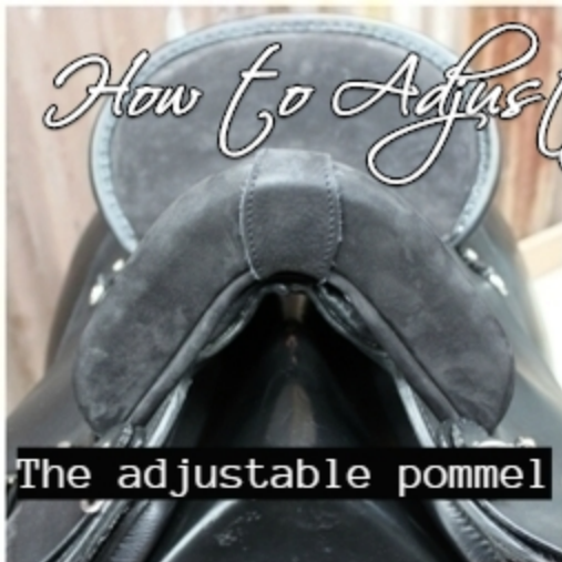
The adjustable pommel