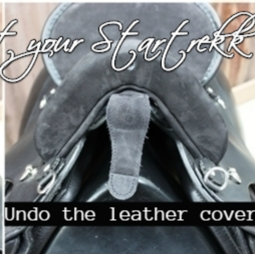
Undo the leather cover