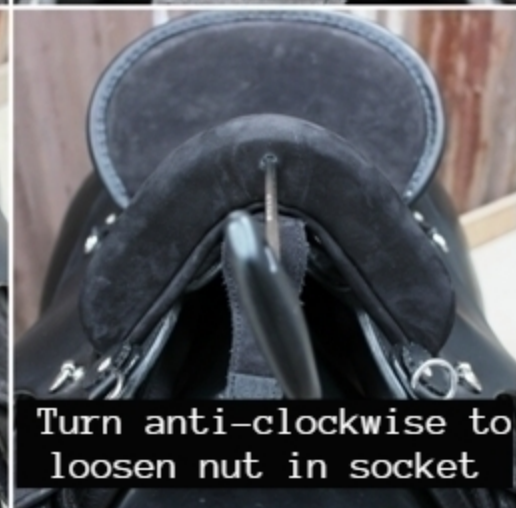
Turn anti-clockwise to loosen nut in socket