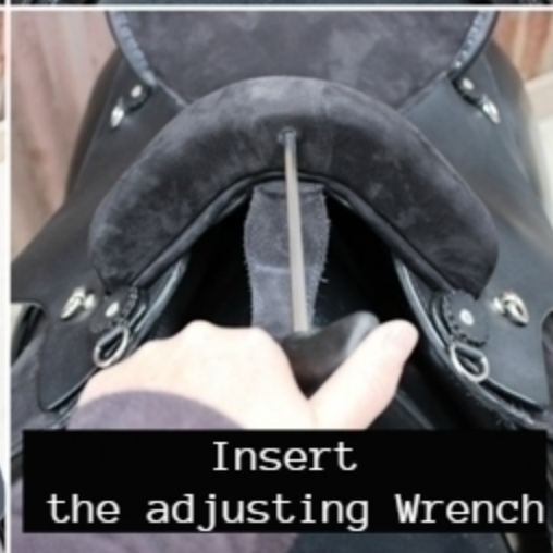
Insert the adjusting Wrench