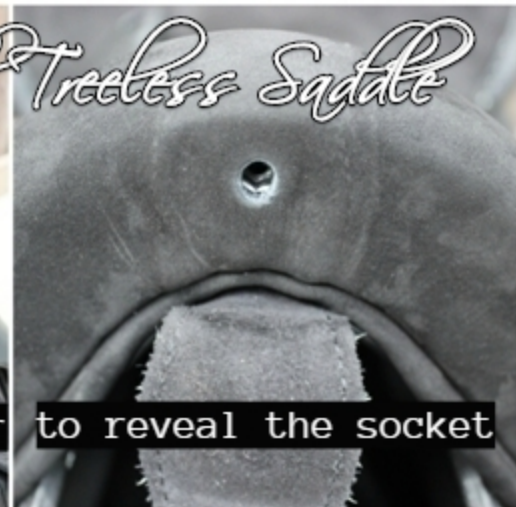
to reveal the socket