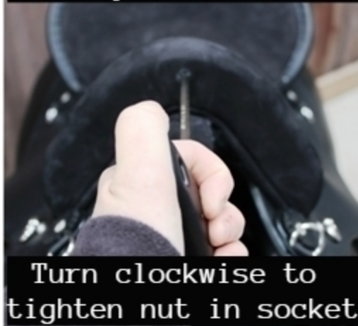
Turn clockwise to tighten nut in socket