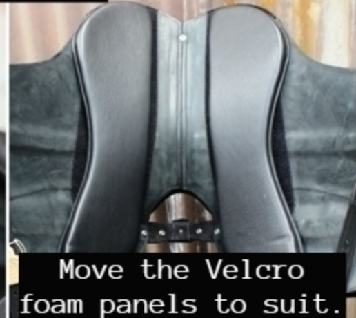
Move the Velcro foam panels to suit.