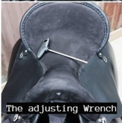
The adjusting Wrench